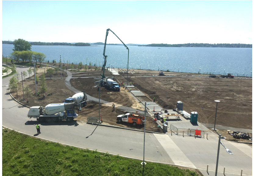
The "commencement lawn" in front of the Campus Center takes shape as workers install a handicapped-accessible pathway that connects to the HarborWalk.